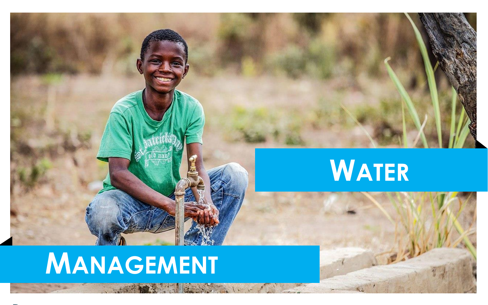
Providing refugees and local communities access to clean water